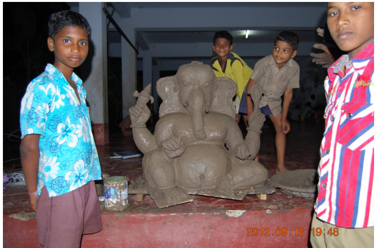
Balavihar members beside the Ganesh Idol prepared

Sri Ramakrishna Jayanti was celebrated on 13 March, 2013. Puja was performed in the morning. Sankirtan and lecture were conducted in the evening. The Birthday