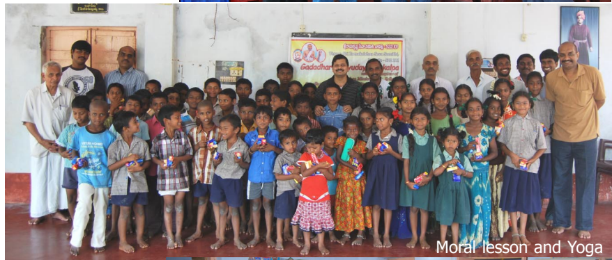
Moral lesson and Yoga classes in progress