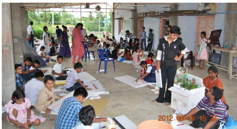
Competition in progress