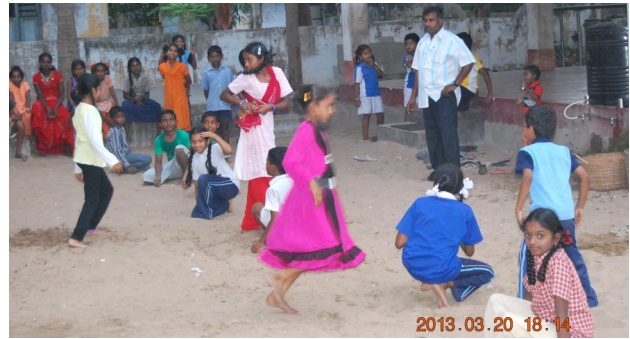
Gadadhar Prakalpa: Play and feeding in progress.

Gadadhar Abhyudaya prakalpa is a central government sponsored pro-gramme