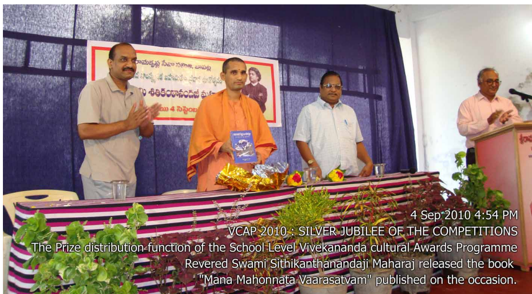
4 Sep 2010 4:54 PM VCAP 2010 : SILVER JUBILEE OF THE COMPETITIONS The Prize distribution-function of the School Level Vivekananda cultural Awards Programme Revered Swami Sithikanthanandaji Maharaj released the book "Mana Mahonnata Vaarasatvam" published on the occasion.

From 27.08.2010 to 29.08.2010 competitions were conducted for college youth. Various competitions like Essay writing, Elocution in English and Telugu, Debating, Quizzes like General quiz, Culture quiz, Spot painting, Group discussion, Singing devotional songs, patriotic songs etc. were conducted. Topics like the life and message of Swami Vivekananda, and topics of cultural significance and national importance were primarily used for the competitions. A total of more than 500 students from 25 different colleges Guntur and Prakasam districts participated.